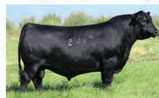
COLEMAN TRIUMPH 9145 SIRE