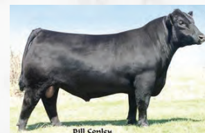
B C LOOKOUT 7024 SIRE