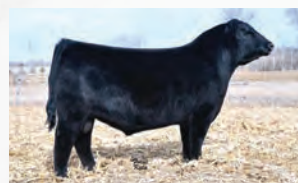
BUSHES GRIT 501 SIRE