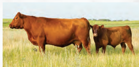
Summer pic of Lot 103 and Dam HRA 56B

Join Us for Lunch at Noon! Sponsored by FCC