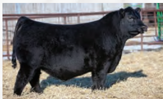
BROOKING RETRO 9071 SIRE