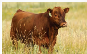
RED TRIPLE H KLINTON 85K

This stylish, smooth made, long bodied, good hipped, wide topped stud is sired by Triple H Intuition 19H, a Blk/Red Carrier bull that goes back to Triple H Intuition 14B and Six Mile Sakic. Very interesting combination here. 85K will be the 4th bull to sell that his C-Bar Anticipation Dam 10c has raised. Here's a chance to inject some Top notch Black genetics into your Red Herd. With a BWT of 81 lbs and a 205 WT OF 760 LBS this guy will work in the heifer pen or on cows and you'll have some pounds to sell in Fall. CE 5 BW 0.5