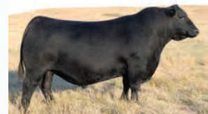
S A V BLOODLINE 9578 SIRE