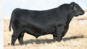
GRASS ROOTS BOND 007 SIRE