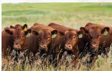
From Left to Right: 82K, 85K, 20K, 14K