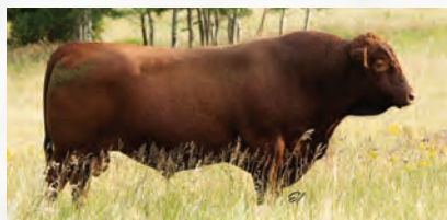
RED TRIPLE H LITTLE DEEP 103G Sire of Lots: 100, 101, and 103

We decided to once again have our Red Angus bulls in the Sale this year. As I sat down to write the footnotes on this strong set of Red Bulls, I realized from this group of 7 cows we have sold 23 bulls and 3 heifers at Red Roundup. There are also 2 Canadian Angus Association Elite Dams in this group.