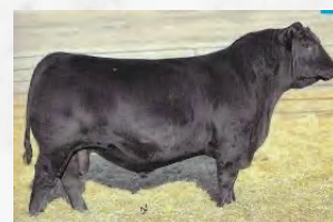
ELLINGSON THREE RIVERS 8062 SIRE